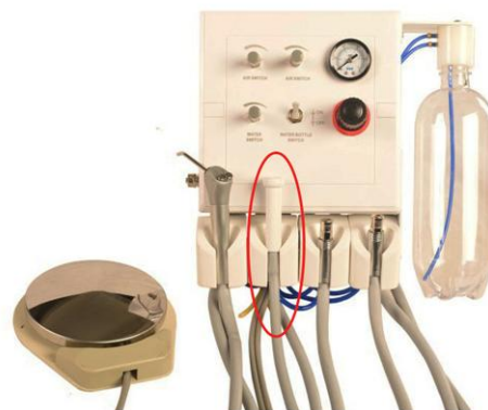
Add Saliva Ejector type